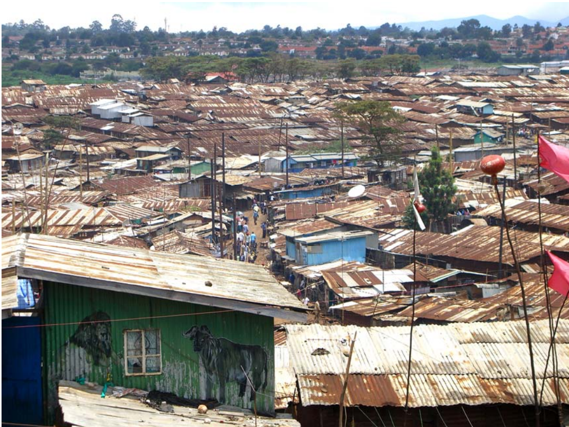
Figure 3. Informal settlement Kibera in Nairobi, Kenya covers 150 ha for 1 mill+ slum dwellers.

Today there are about 1 billion slum dwellers in the world, while in 1990 there was about 715 million. UN-Habitat estimates that if the current trends continue, the slum population will reach 1.4 billion by 2020 if no remedial action is taken. In 2005 the world's urban population was about 3.2 billion out of world total of about 6.5 billion. Today in 2007 is the year that most people throughout the world live in urban areas. Current trends predict the number of urban dwellers will keep rising, reaching almost 5 billion in 2030 where 80% will live in developing countries. Over the next 25 years, the world's urban population is expected to grow at an annual rate of almost twice the growth rate of the world's total population. (UN-Habitat, 2006). In this perspective, where one of every three city residents lives in inadequate housing with few or no basic services, it becomes urgent to focus on informal settlement and find ways and means to influence government policies and actions. This also relates to the Millennium Development Goal 7, target 11 stating that by 2020 to have improved the lives of least 100 million slum dwellers.